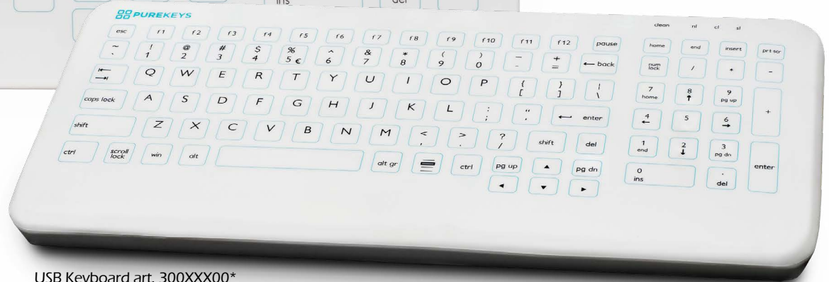
USB Keyboard art. 300XXX00*