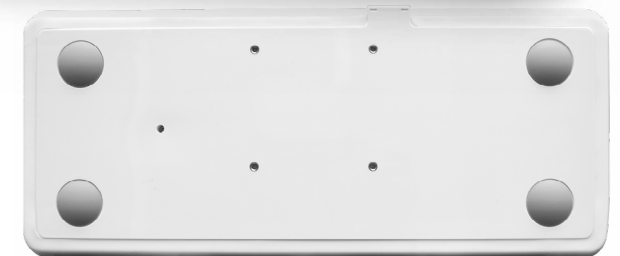
300XXX00 bottom: 6 rubber feet, 4 x 5mm, 2 x 15mm supplied for different angles + Brass inserts on 75 mm VESA distance

Other countries and customized layouts available upon request.