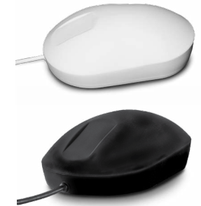
Disinfectable USB Mouse with touch scroll White art. 40065 Black art. 40265